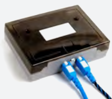
LA-WLDM Addressable Interface Module