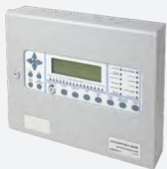
LAAP-S-1 Addressable Control Panel