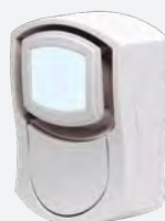
HSVS Alarm Activated Voice Sounder