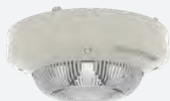
CHQ-ARI Loop Powered Remote Indicator