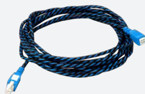
LAW-10 LEAKalarm Wire 10m/5m