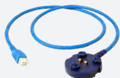
LA-WLDP LEAKalarm Detection Probe